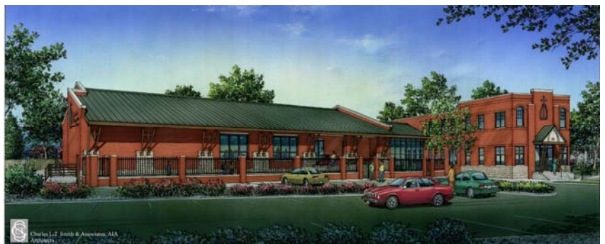
The New Marian House 2005