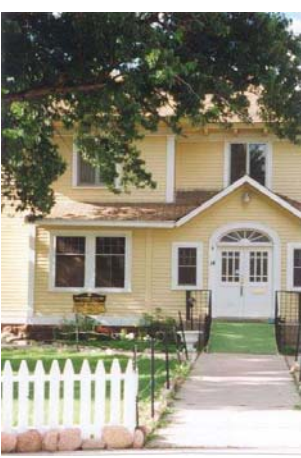
The current Marian House Soup Kitchen.