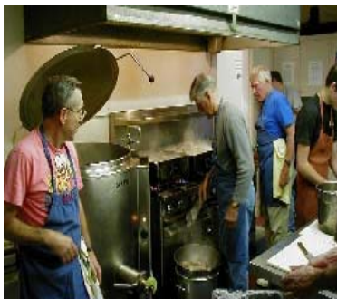
Volunteers from First Lutheran Church cook soup in the Marian House kitchen