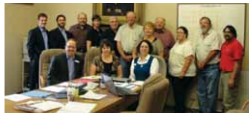
KIT CARSON COUNTY COMMISSIONERS AND STAFF' REPRESENTATIVES OF THE RED CROSS AND CC.