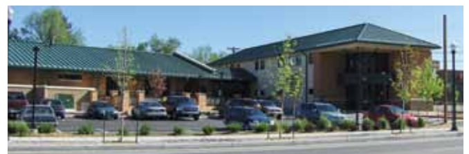
THE NEW MARIAN HOUSE COMPLEX

Twenty years after that first meal was served, many things have changed but one thing remains constant: our community cares and continues to reach out to provide for those less fortunate. Thank you for your support of this ecumenical ministry.