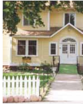
THE OLD MARIAN HOUSE